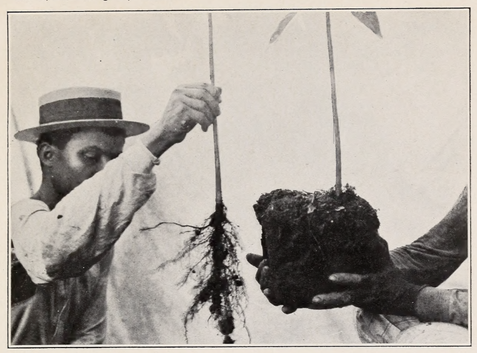
Fig. 1.—Coffee Roots Bare and in Ball of Soil.